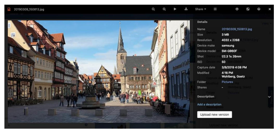
Details view with Exif data